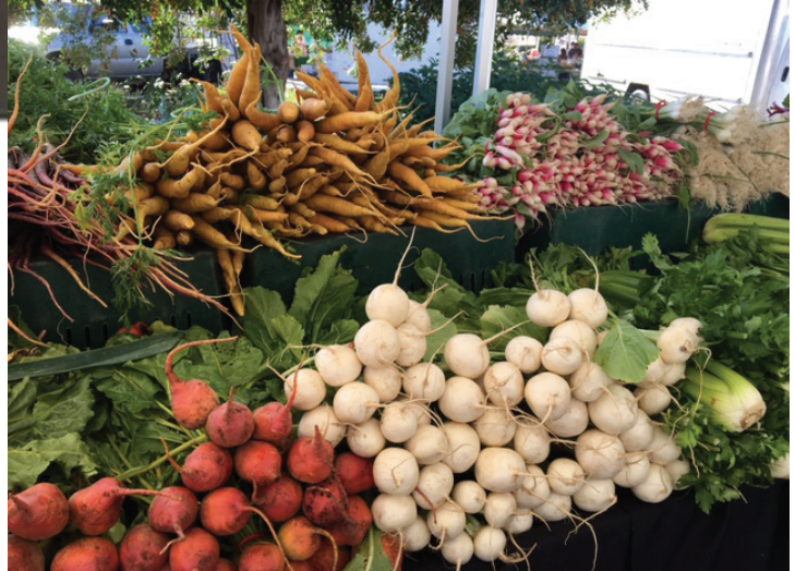
Just a small sampling of the vibrant fresh food on offer.

For upcoming events at the Encino Farmers Market such as the community blood drive with the Red Cross on July 7, new vendors or market news, follow ONEgeneration Farmers Market on Facebook @ EncinoFarmersMarket or visit www.EncinoFarmersMarket.org.