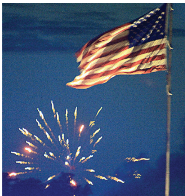
Have a Safe and Celebratory 4th of July!